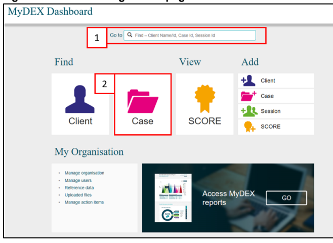
Figure 1 - Data Exchange home page